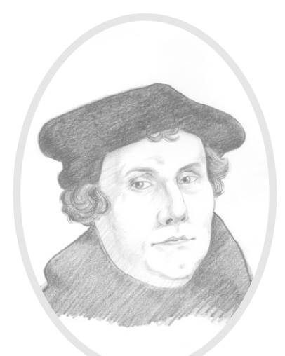
"To be a Christian without prayer is no more possible than to be alive without breathing."

12 I fast twice in the week, I give tithes of all that I possess.